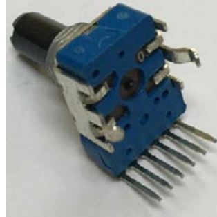
View of the finished product with new housing: