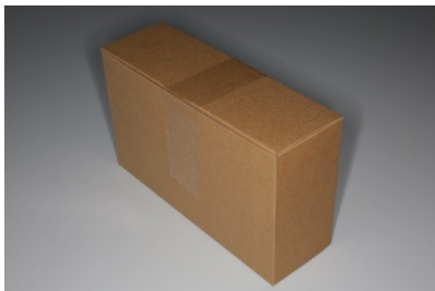
Old cardboard box